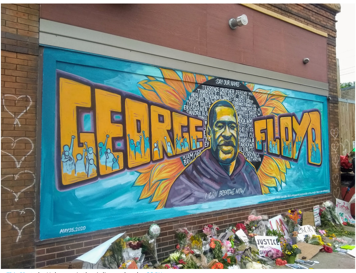
<u>This Photo</u> by Unknown Author is licensed under <u>CC BY</u>